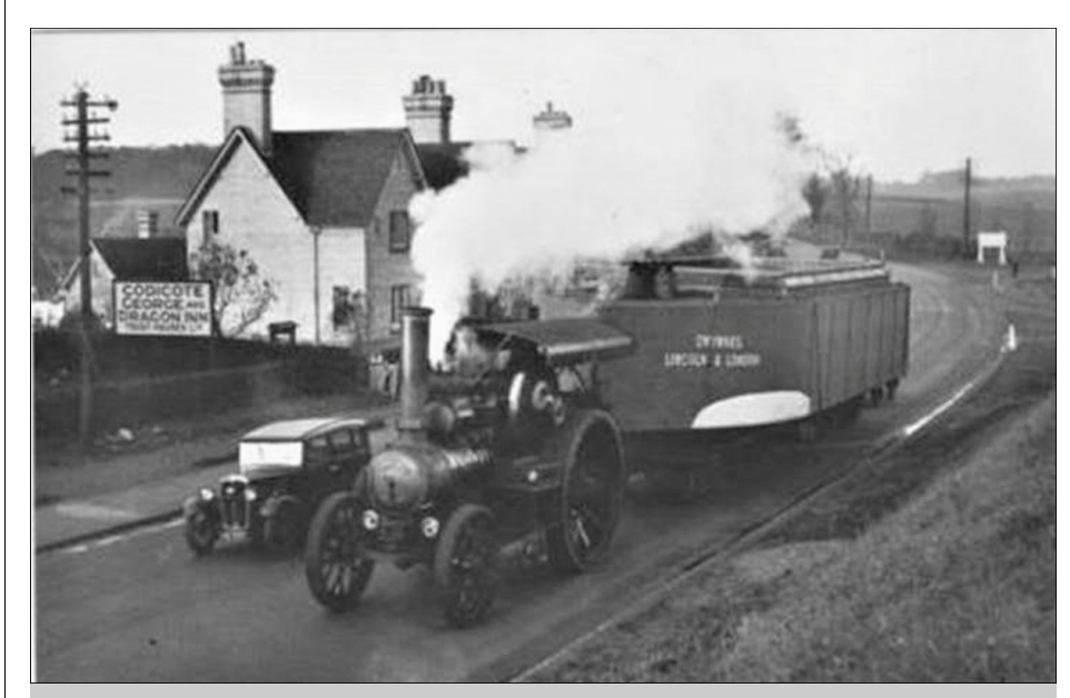
Fowler steam road locomotive on Great North Road, late 1920s

We found out where Lemsford got its name and the part the Romans played in developing Lemsford. In the Golden Age of Lemsford when the Great North Road went through Lemsford it is said as many as 150 coaches a day passed through. All the inns would have offered food and drink for the travellers. Accommodation would have been provided if required. Wheelwrights and blacksmiths were available to service the wagons and horses. Stabling for the horses would also have been provided. The talk also included the history of Brocket Road, New Road and Great North Road as it developed in the 1920's.